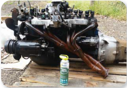
Parts Storage Protection