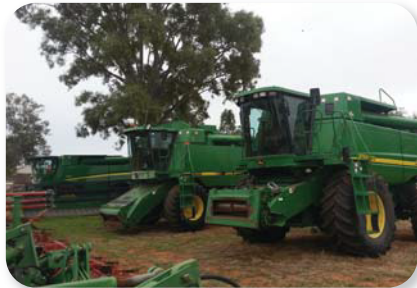
Plant & Machinery