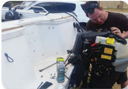
Marine Grade Protection