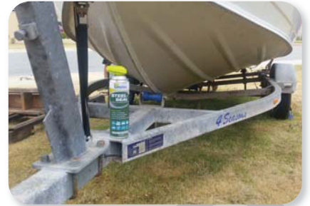
Trucks, Trailers, & Caravans